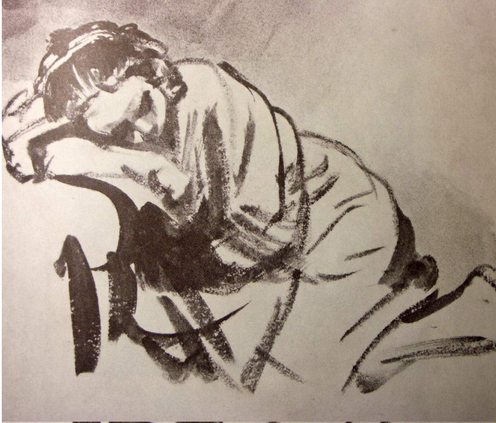
Rembran dt drawing